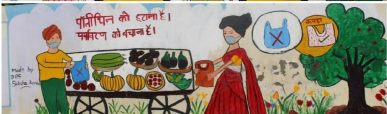
All India wall painting day of SBM messages in villages done by DPS Shiksha Kendra students, August 11, 2020 at Govt. Girls Primary School Kanhai.