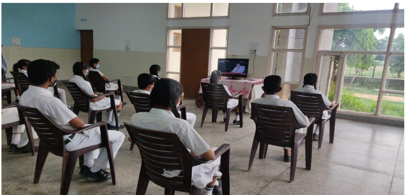
Webcast of inauguration event organised for DPS Shiksha Kendra students at Community Centre, Sec-45 by their teachers