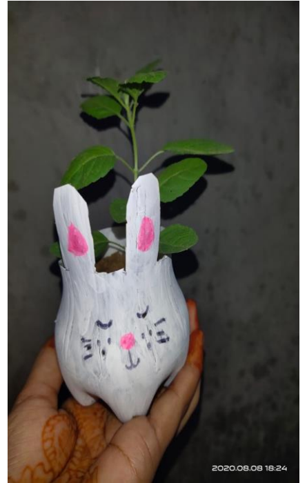
Converting used plastic bottles into planters, August 12, 2020