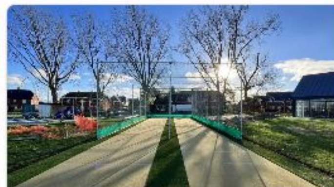
📄 Game 10: Kingston Bagpuize CC