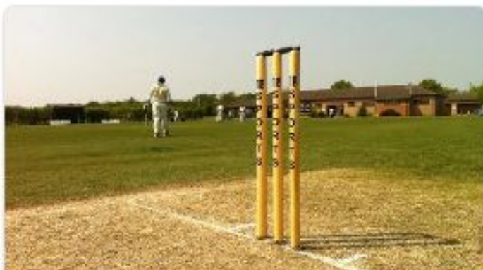
📄 Game 4: Bicester & North Oxford CC