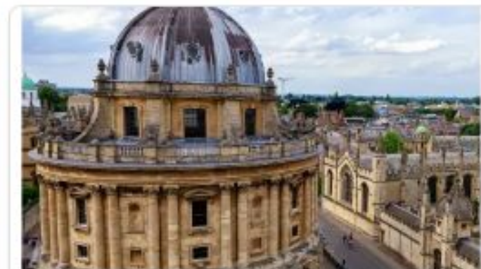
📄 An Oxford Odyssey