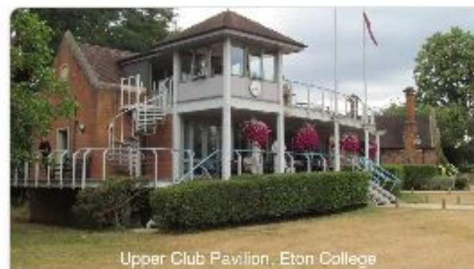
📄 Game 2: Eton College