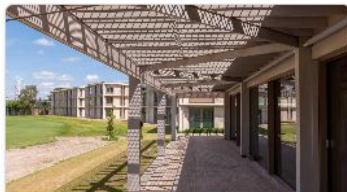
📄 Game 5: OUCCC