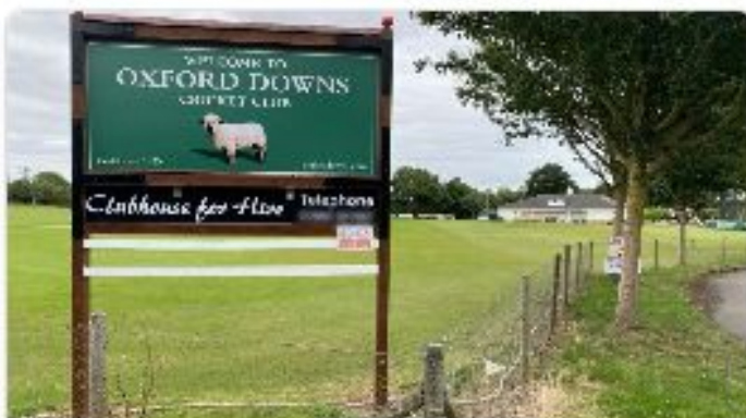
📄 Game 8: Oxford Downs CC