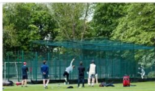
📄 Academic Brief & Exclusive Net Session