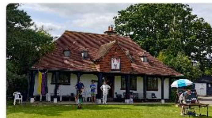
📄 Game 3: ISIS CC