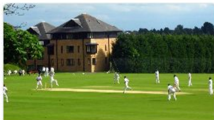
📄 Game 1: Oxenford CC