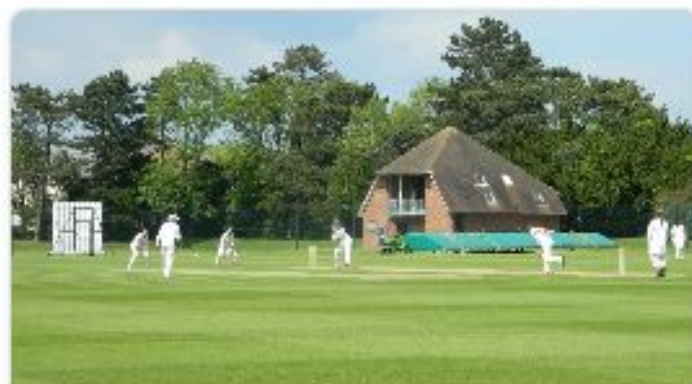
📄 Game 9: St Clements Strollers