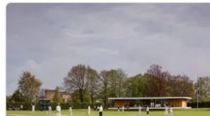
📄 Game 6: St Edward's School