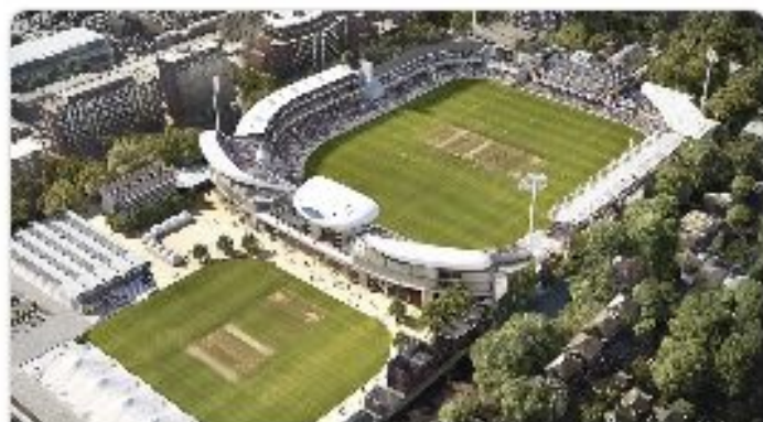
📄 Lost in London