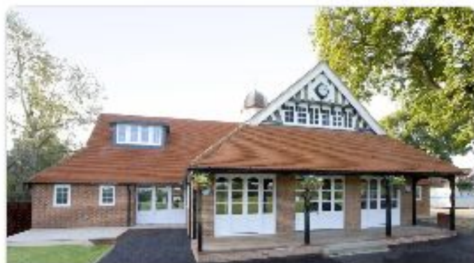
📄 Game 7: St John's CCC