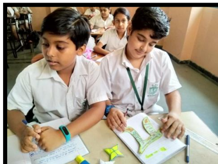
Students showing creative depiction of \pi