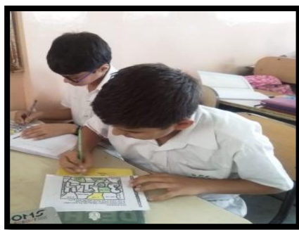
Engrossed in Jigsaw Puzzle