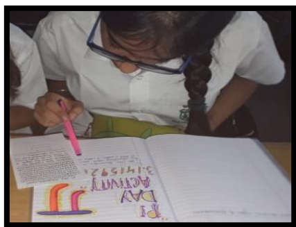
Students participating in ‘Pi’ Word Challenge